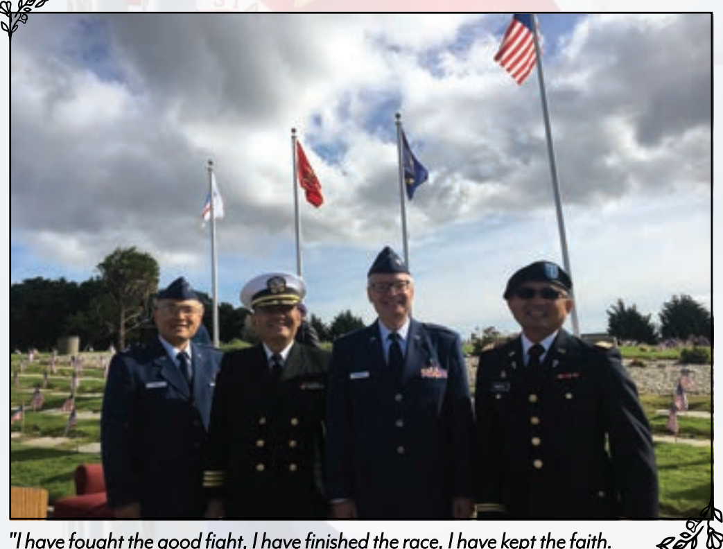
"I have fought the good fight, I have finished the race, I have kept the faith. Now there is in store for me the crown of righteousness." - 2 Timothy 4: 7-8

By choosing a Catholic Cemetery, you select a final resting place that reflects the beliefs and values of life's personal journey.